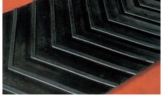
V-Cleat Conveyor Belt